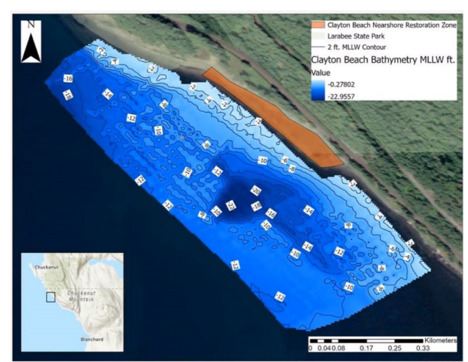
Boundaries of survey and eelgrass